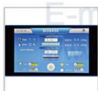
5 inch Touch Screen