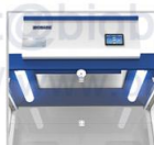
Oil Proof Explosion Proof Light